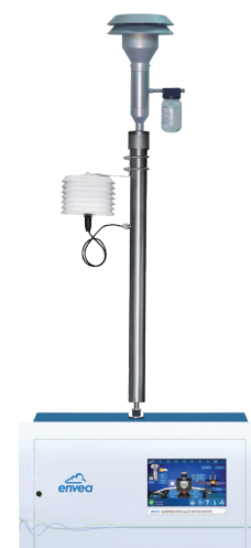
Complete measurement system with RST sampling tube and sampling head